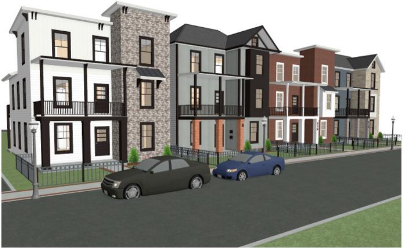
EXHIBIT C-2 RENDERING: SOFLO PROJECT AREA